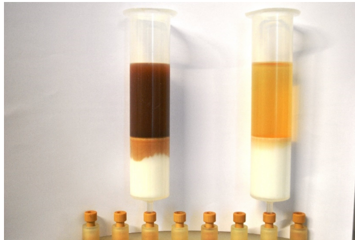
Figure 1 □ Example SPE extraction

where BC is the value of the blank measured after SPE (see 4.5).