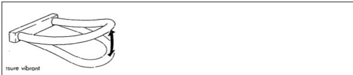
Figure 1: Vibrating measuring tube

Electronic densimeters operate according to the vibrating measuring tube principle (fig. 1): the fluid is introduced into a U-shaped tube and subjected to electromagnetic excitation (fig. 2 and fig. 3).